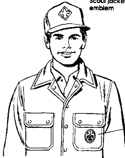
Jac-shirt, on left pocket